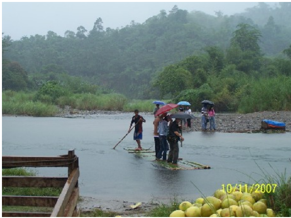
Our team crossing the Apayao river in a “balsa” (bamboo raft) to go to medical site