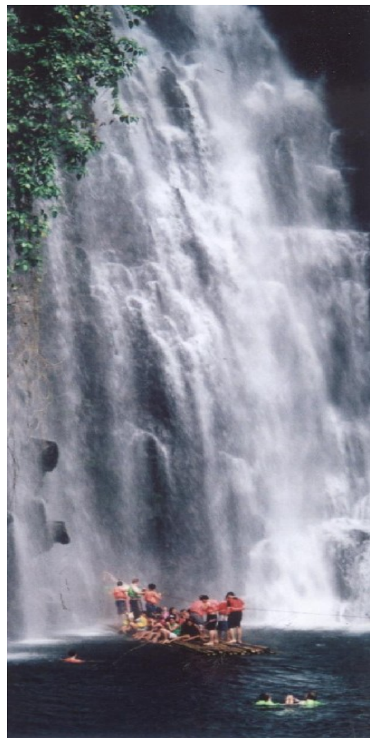
Our team enjoying recreation in Iligan City